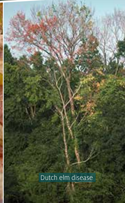
Dutch elm disease