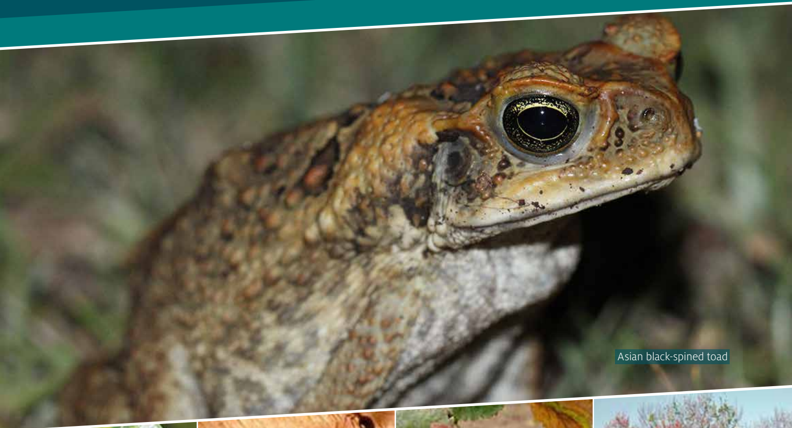
Asian black-spined toad