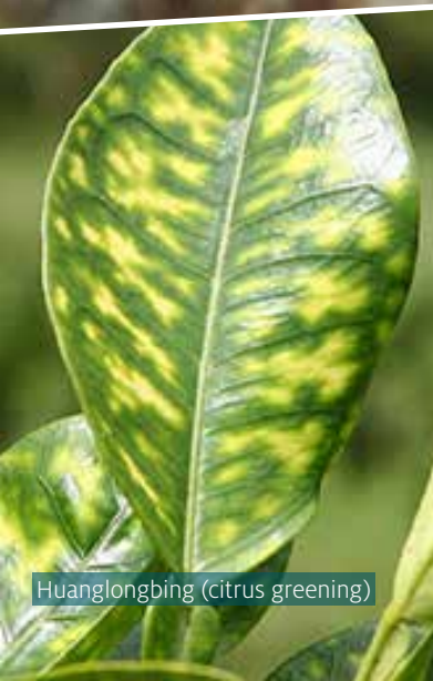
Huanglongbing (citrus greening)