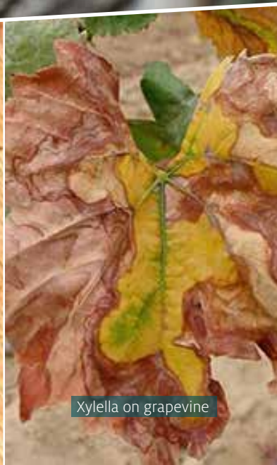
Xylella on grapevine