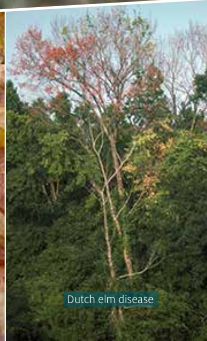
Dutch elm disease